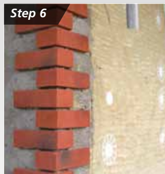
BrickShield® Special-shaped Clay Brick Slips are available for corners and reveals.