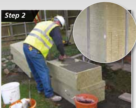
Step 2 Rockwool® Façade Ultra coated with BrickShield® Adhesive Mortar is then applied to sound, dry and smooth masonry.