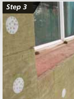
Step 3 Fix with BrickShield® Insulating Wall Anchors for ultimate durability.