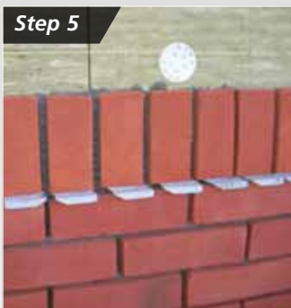
BrickShield® Spacers can be used temporarily until the mortar sets.