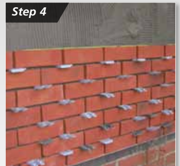
Step 4 BrickShield® Adhesive Mortar is then applied to the surface of the Rockwool® Façade Ultra. BrickShield® Natural Clay Brick Slips are laid onto the adhesive mortar, keeping to line and level for an even appearance.