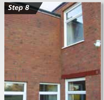
Reveal trims and extended sills are fitted as required.