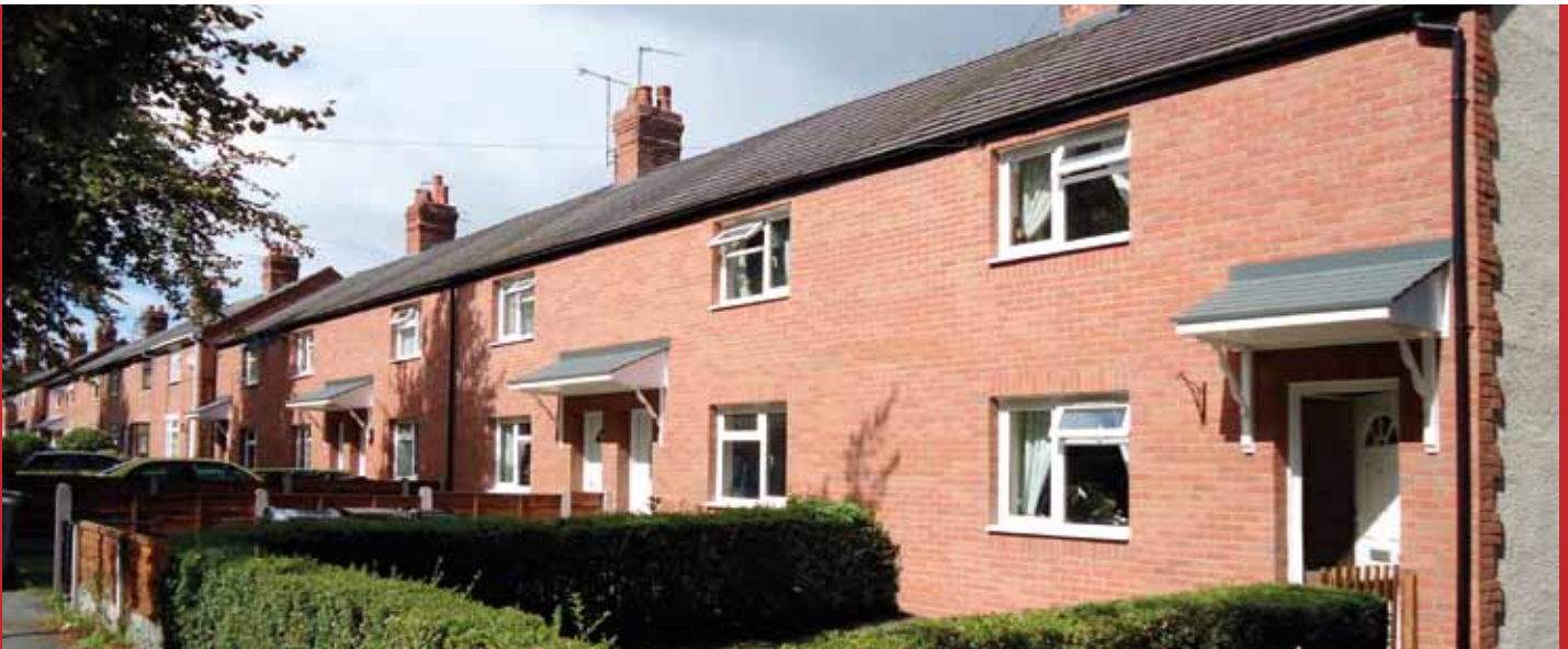
Terraced Housing Refurbishment, Middlewich, Cheshire | Brickshield