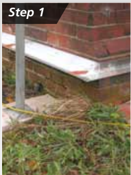
Step 1 Fix starter channel. Capping trims are also available.