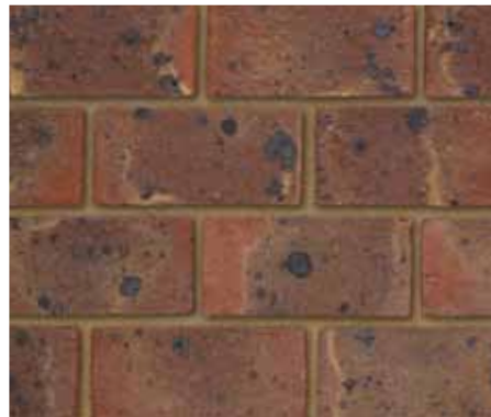
Hamsey Multi Stock Paver