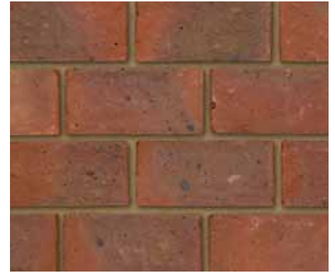
Beckley Medium Multi Stock Paver