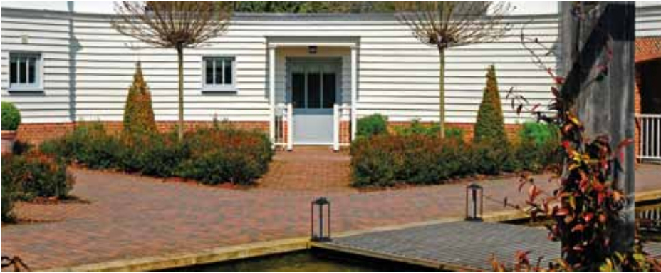
Hotel, Lyndhurst, Hampshire | Chailey Multi Stock Paver