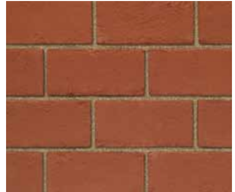
Laybrook SUDS Flame Red Stock Paver