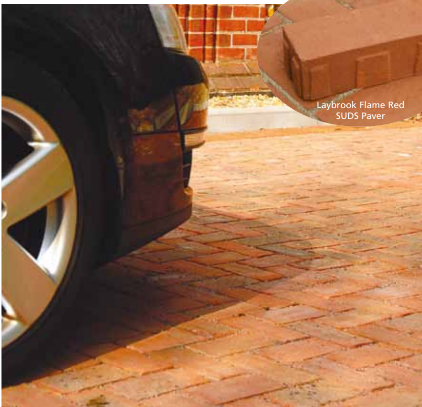
Laybrook Flame Red SUDS Paver

Ibstock also offers other clay paver options; rigid pavers, bedded and jointed with mortar on a concrete sub-base and flexible pavers, bedded on an approved sub-base.