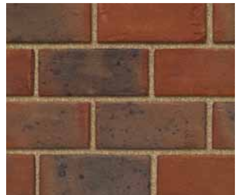
Laybrook SUDS Red Multi Stock Paver