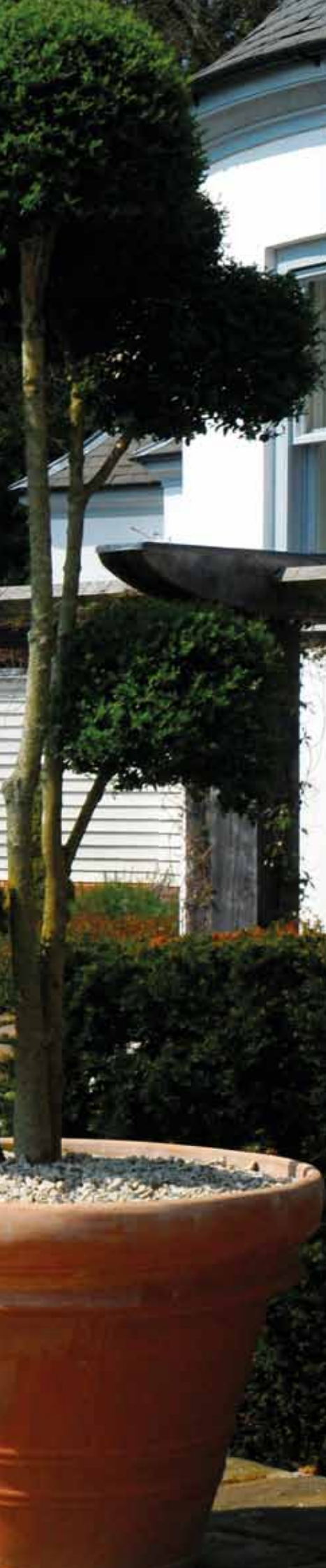
Hotel Gardens, Lyndhurst, Hampshire | Chailey Multi Stock Paver