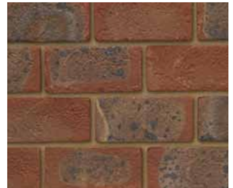
West Hoathly Sussex Stock Paver