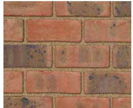
Laybrook SUDS Multi Stock Paver