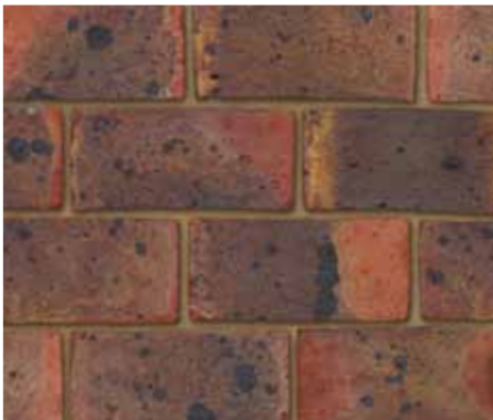
Chailey Multi Stock Paver