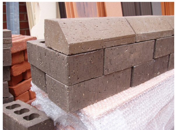
Due to different extrusion processes, the drag wire marks on the plinth bricks run horizontal whilst the standard bricks are vertical.

Finally, many special shapes are in an exposed position such as sills or plinths and only F2 (frost resistant) products are suitable in locations such as these.